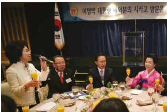
2011 이명박 대통령 내외분의 시카고 방문행사중 건배제의