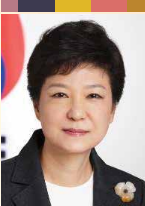
Park Geun-Hye President The Republic of Korea