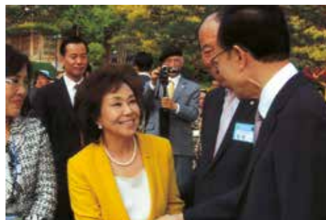
2012년 진안순 회장. 청와대에서 이명박 대통령께 감사 후 인사 장면