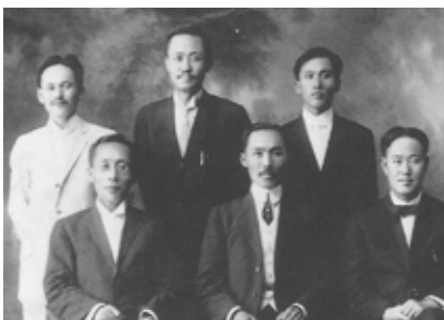
대한인 국민회 하와이 지방총회 간부진용