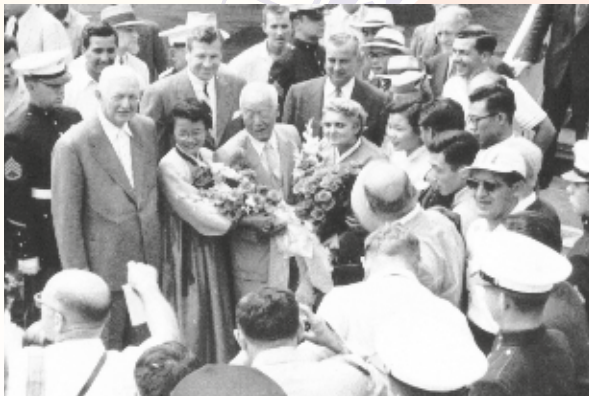
1954년 시카고를 방문한 이승만 대통령 내외