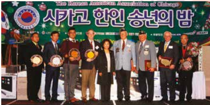
2015 시카고 한인 송년의 밤