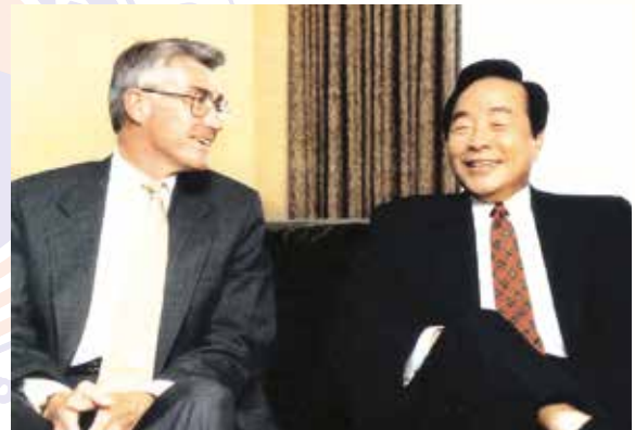
김영삼 대통령과 일리노이 주 주지사