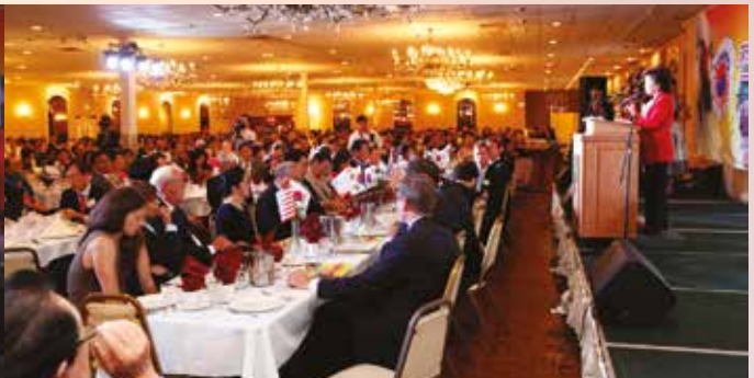
제 32대 시카고 한인회장 이취임식