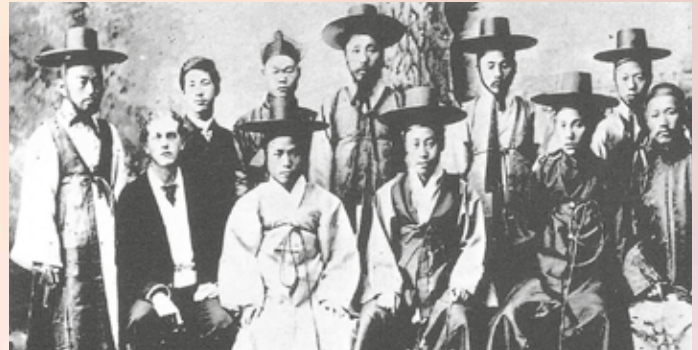
민영익 특명전권대사 일행 시카고 방문(1883)