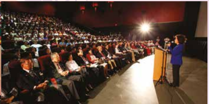
70주년 광복절 기념식