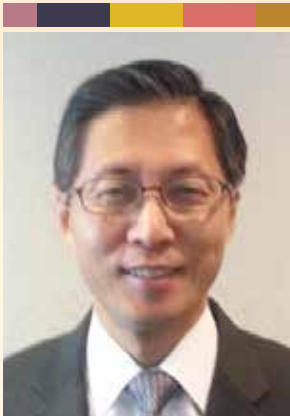
Sang I. Kim, Korean Consul General Republic of Korea of Chicago