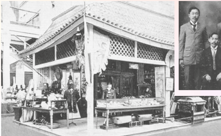
1893년 시카고에서 열린 세계 박람회