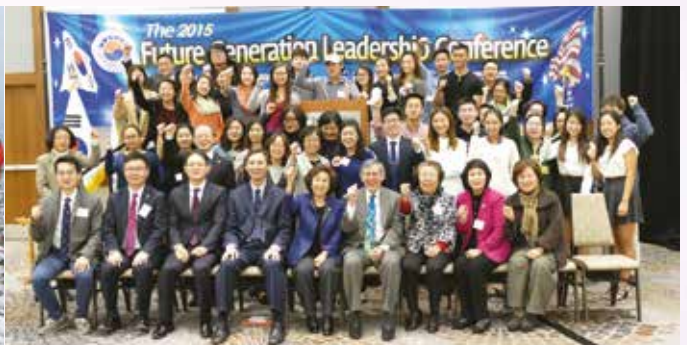
The 2015 Future Generation Leadership Conference