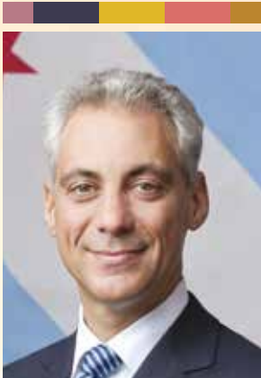
Rahm Emanuel Mayor of Chicago