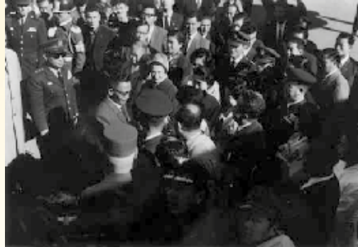
위기에 빛난 대통령 박정희 박정희 의장 61년 케네디 대통령 초청 ... 박의장은 동경을 거쳐 시카고, 워싱턴, 뉴욕, 샌프란시스코, 호놀룰루 등 도시를 방문하게 될 스케줄이며 박, 케네디 회담은 지난 54년 7월 이승만 전 대통령이 아이크 ...