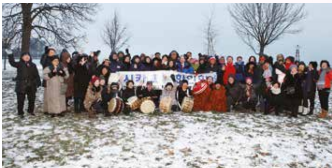
2016 시카고 한인회 해맞이 행사